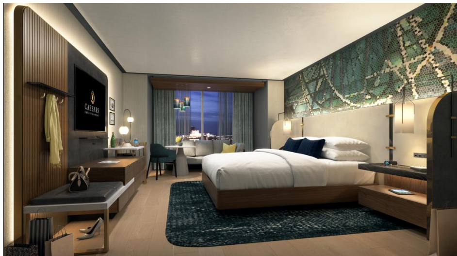
The All-New Atrium Hotel Tower at Harrah's Resort Rendering

All five new offerings will open in time for Memorial Day weekend, with the first phase of the Atrium Tower project completed by Summer 2021.