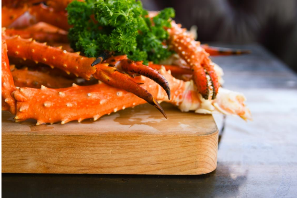
Rum Point Crab House