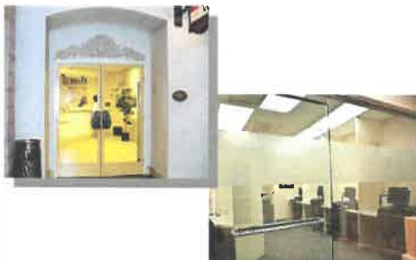
Paris / Bally's Business Center

Paris Bally's Business Center 3655 Las Vegas Blvd., South Las Vegas, NV 89109